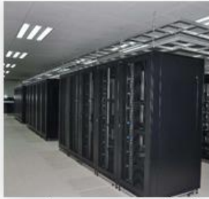
Computer room monitoring