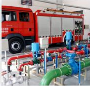
Fire Control System